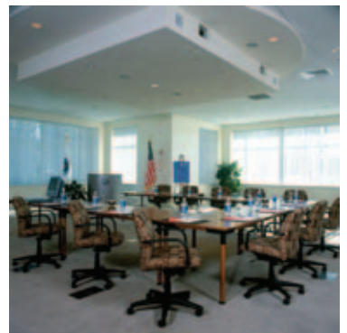
Right Column: Interior views of Waltham Woods, Waltham, MA