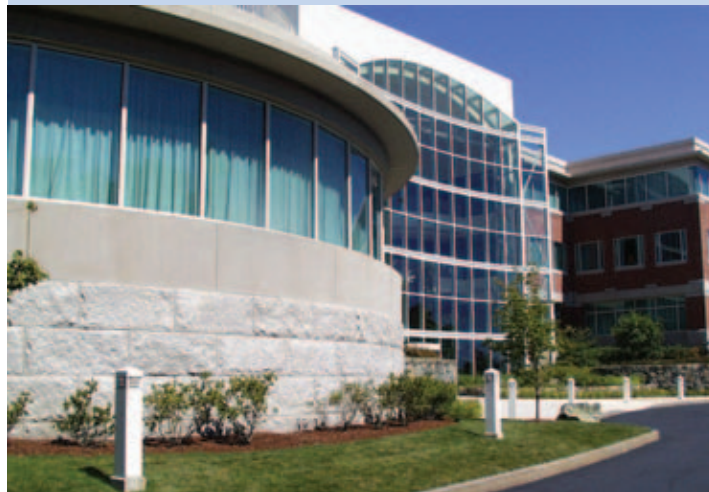
Waltham Woods, Waltham, MA